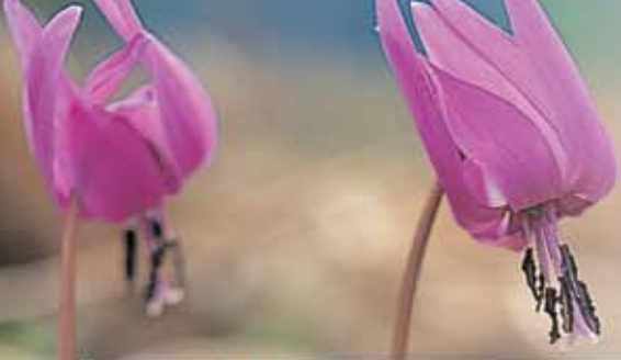
かたくり Dogtooth Violet