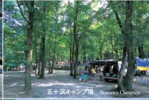
五十沢キャンプ場 Ikazawa Campsite