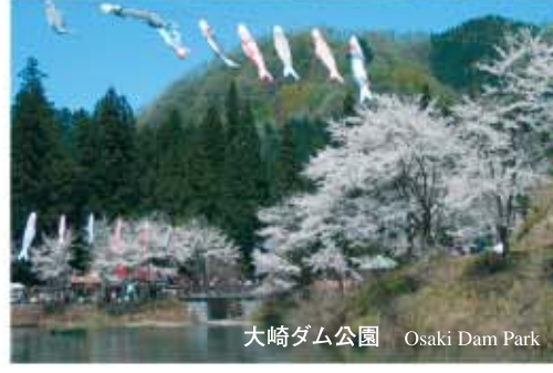
大崎ダム公園 Osaki Dam Park