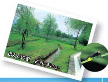
ほたるの里 Firefly Village