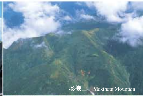
巻機山 Makihata Mountain