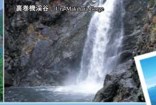
裏巻機溪谷 Ura-Makihata Gorge