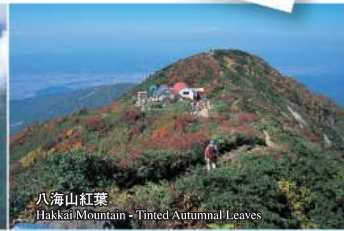
八海山紅葉 Hakkai Mountain - Tinted Autumn Leaves