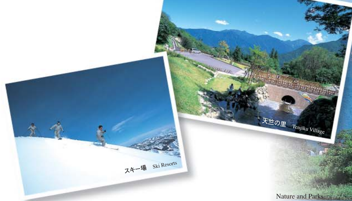
スキー場 Ski Resorts