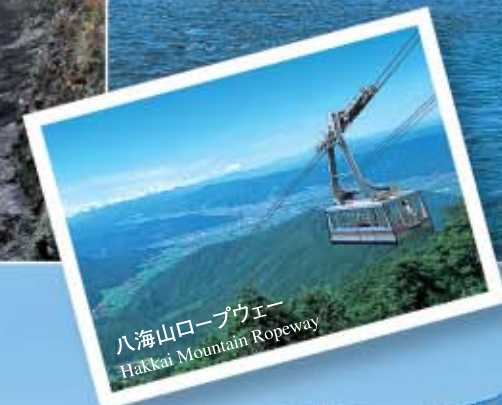
八海山ロープウェイ Hakkai Mountain Ropeway