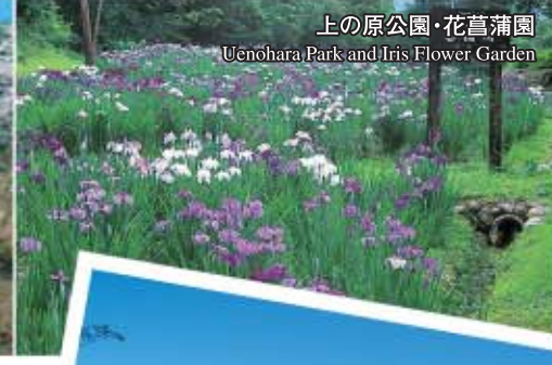
上の原公園・花菖蒲園 Uenohara Park and Iris Flower Garden