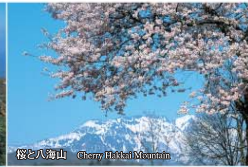
桜と八海山 Cherry Hakkai Mountain