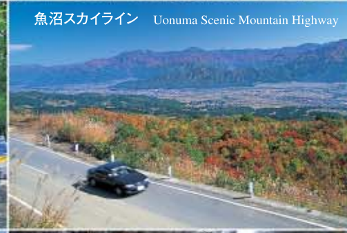
魚沼スカイライン Uonuma Scenic Mountain Highway