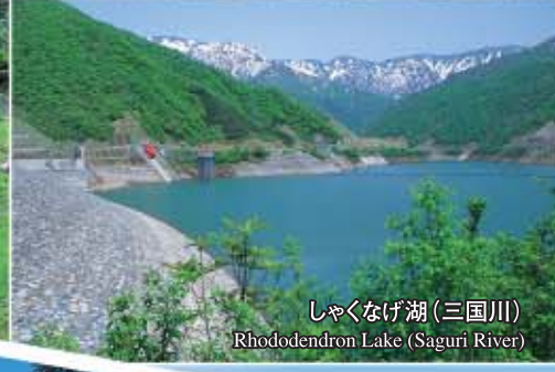
しゃくなげ湖(三国川) Rhododendron Lake (Saguri River)