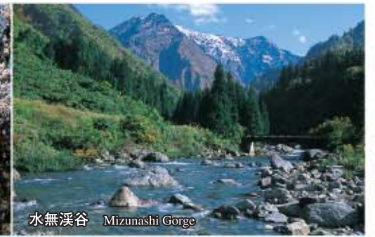
水無溪谷 Mizunashi Gorge